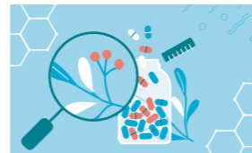
Everything You Need to Know about Supplements