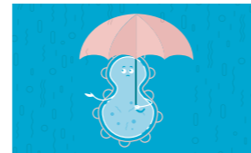
The Best Foods for Leaky Gut