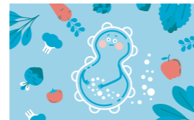
How to Prevent Bloating After Eating