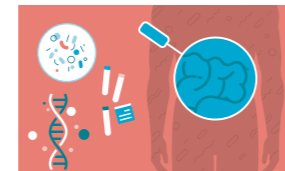
Gut Health Testing – All Your Questions Answered

Head to the healthpath.com blog for the latest health insights, including: