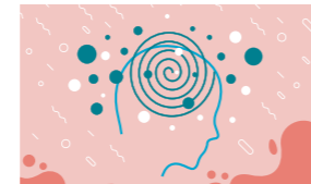
Find Out If Nausea is a Symptom of IBS