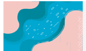
The Lowdown on Dysbiosis